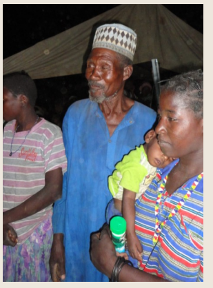
Blind Man Healed