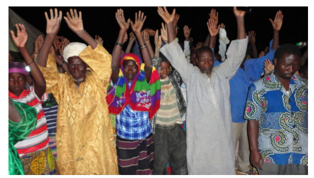
Muslims Respond To Gospel In Outdoor Crusade

M iracles In The Sahara Desert: The greatest miracle is the salvation of a soul. We recently held an outdoor crusade in the midst of an Islamic country of Northern Africa. Every night Muslims ran to the altar when the invitation to receive Jesus was given. The word of God was confirmed through signs and wonders as blind, deaf and lame were healed. Following the crusade, a new church was established.