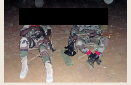
Army Provides Security